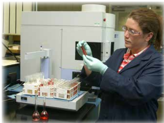
Results are available soon after testing is complete. LE prepares a detailed report for the customer, explaining the data and providing recommendations for any follow-up actions that should be taken.